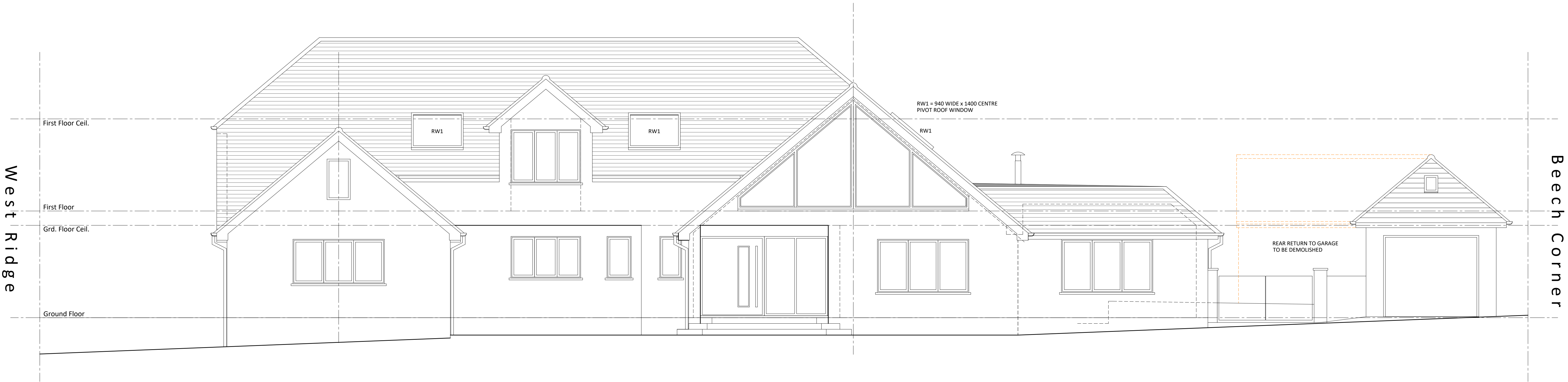
Proposed Front - West Elevation 1:50 Scale